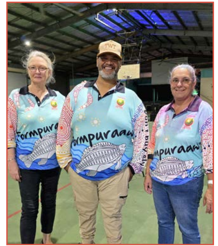
Family fun in Pormpuraaw: bonfire, tug o' war; table tennis, pool, Big Pups...and a good cause (below)