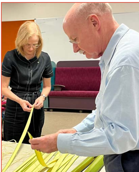
Governor and Professor making grass skirts & farewelling the Governor.