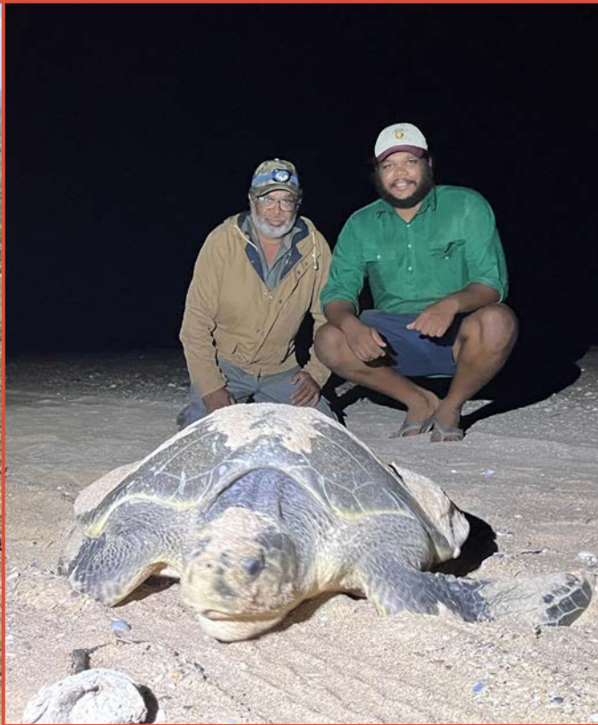
Top & Left: aerial views of Pormpuraaw and carbon burning from the helicopter.